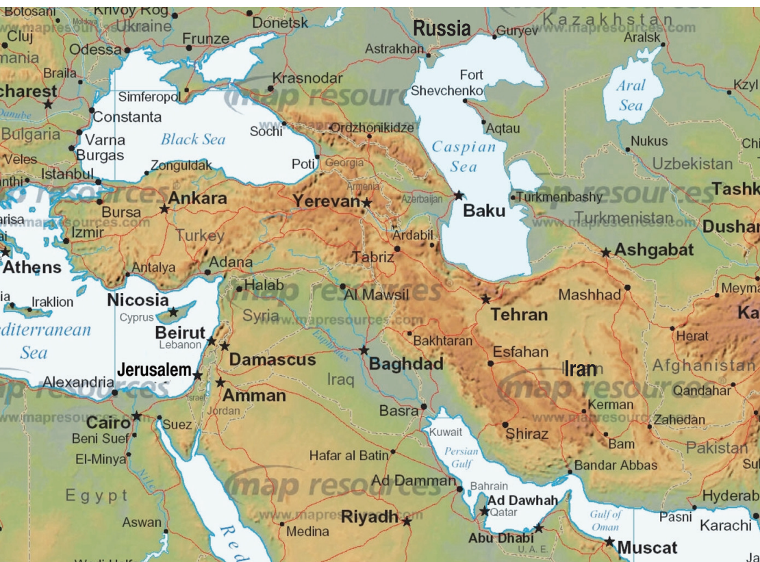
Land and sea attack caught world by surprise.

The dark cloud of expectation has finally burst. The Russian army has slashed across the plains of Iran, swept through the cities of Tehran and Esfahan and is pressing toward the strategic Persian Gulf region. Military experts estimate the Soviet strength at between two and three million men, 20,000 tanks and 1700 bomber and fighter planes. A strong naval assault has also been launched from the Mediterranean Sea. The final objective of the Communist attack is believed to be tiny Israel. Israel is situated at the center of the "land bridge" that connects Europe, Asia and Africa, and is therefore of great military importance. Also the Dead Sea contains many important minerals. One of these minerals, potash, is a vital ingredient in farm fertilizer. When the population explosion begins to bring worldwide famine, potash will become extremely valuable for food production. By conquering Israel and the oil-rich Persian Gulf nations, Russia will attempt to gain control of the entire Middle East and thus have a stranglehold on the oil-starved Western nations.