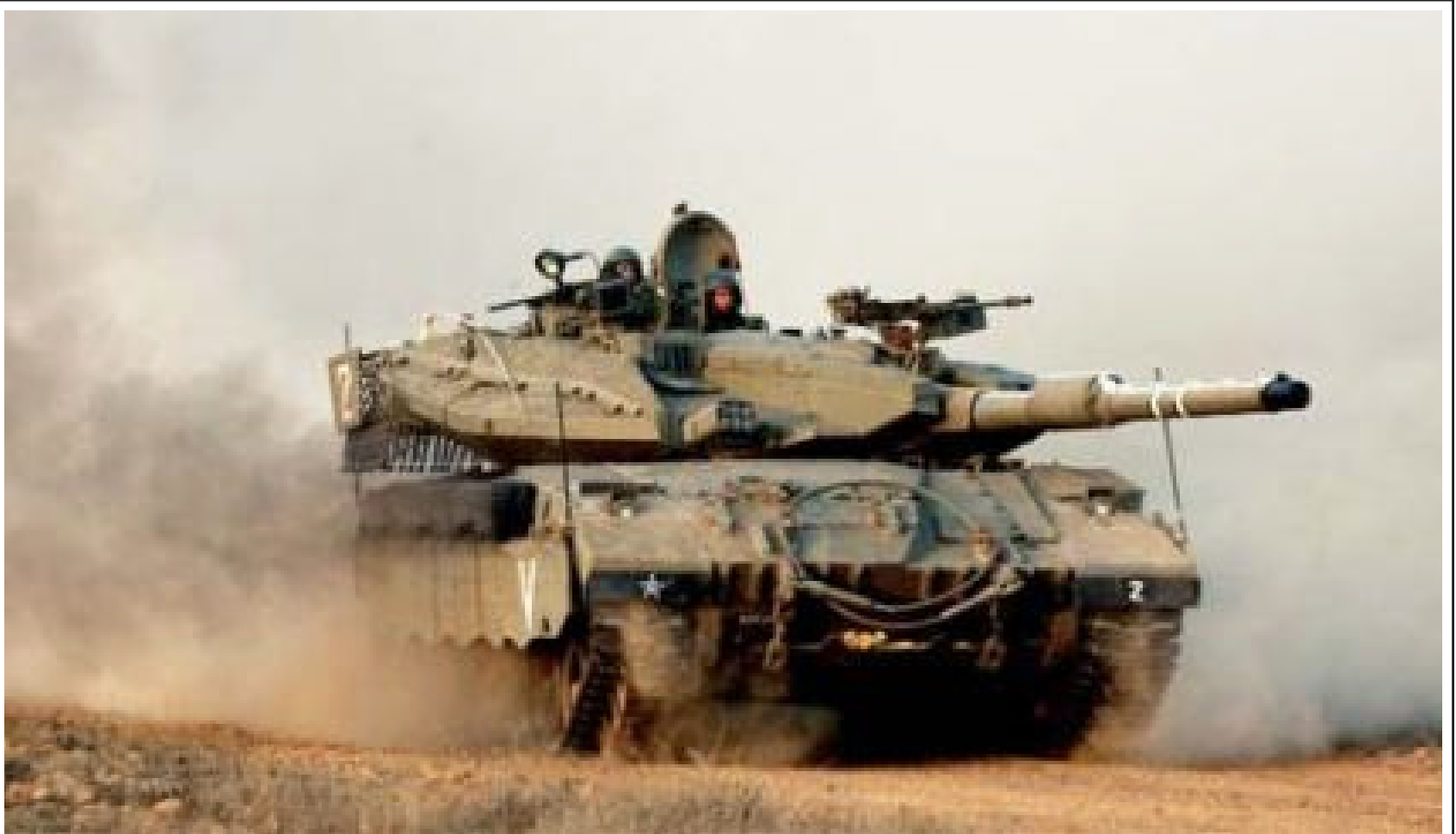
Thousands of Russian Tanks thrust toward strategic Persian Gulf Oil Fields. Page 2