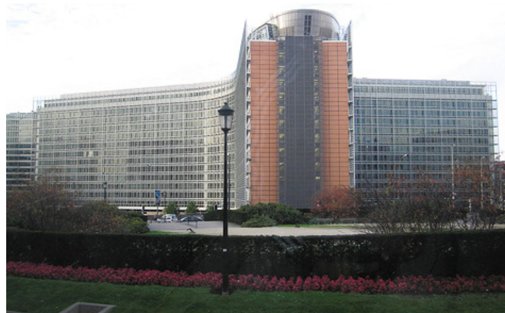
European Federation Headquarters in Brussels, Belgium.

"Since the recent defeat of Russia on the northern plains of Israel, I strongly urge that we as a federation guarantee Israel's military security as this move would balance the scales in the Mideast. I also recommend that we dissolve all paper currency and run the economy with computer bank transfers. This will be achieved by having each individual receive their account numbers in their hand or their forehead with the new "666" symbol above it. This will bring us closer to the utopian society we all desire and anyone not agreeable to this will not be able to buy or sell." After the speech the crowds went wild with applause.